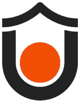
Immersion Programme – Cambridge Exams: 26 Lessons (21 hours per week)